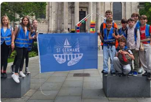
Inspectors highlighted the school's rich programme of extra-curricular opportunities and positive culture of belonging

HOME NEWS SPORT WHAT'S ON SEND YOUR STORY PUBLIC NOTICES JK